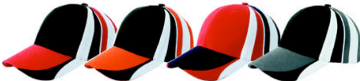
Black/Red/White Black/Orange/White Red/Navy/White Black/Grey/White

* Self-Fabric Strap W/ Velcro Adjustable