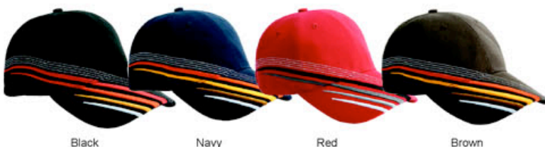
Black Navy Red Brown