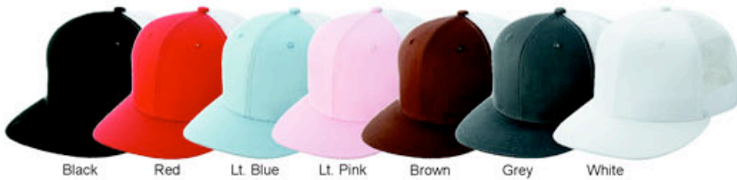
Black Red Lt. Blue Lt. Pink Brown Grey White