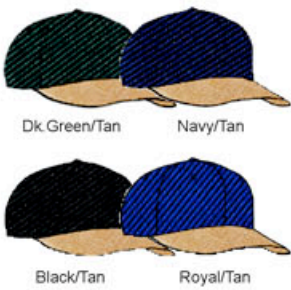
Dk. Green/Tan Navy/Tan Black/Tan Royal/Tan

* 6 Panel W/Fused Buckram Backing * Leather Strap W/Brass Buckle & Grommet